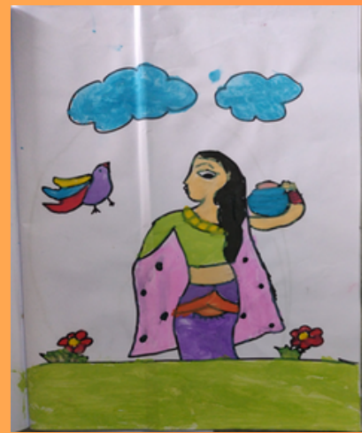
Indu Tapasya V B