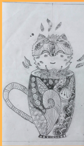
Purushotham V A