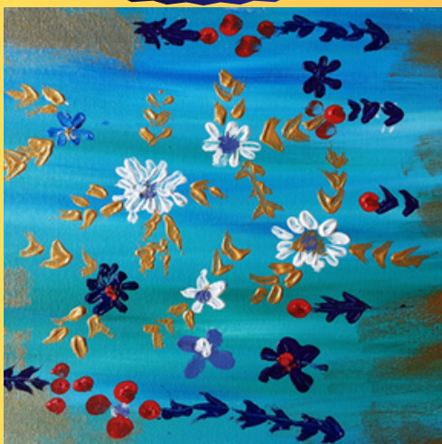
Adithya V B